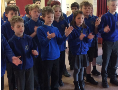
Class 3 performed some Easter songs at our Easter Collective Worship