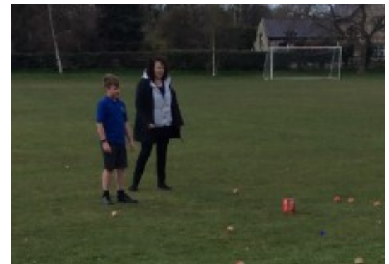
Egg rolling proved pretty tricky.