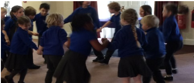
Class 1 Danced an Easter Dance